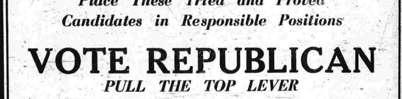
CARL E. HULTINE Insurance Underwriter